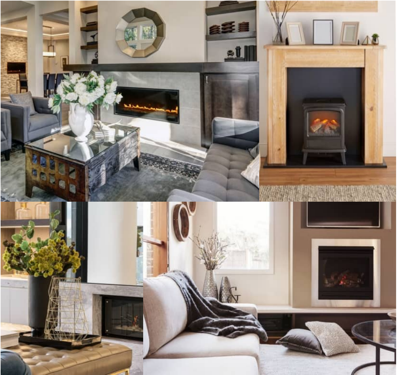
Above – different gas fireplace types and installation settings

Altogether, the reliability, efficiency, and affordability of gas fireplaces makes them a key household heat source in Canada’s energy future.